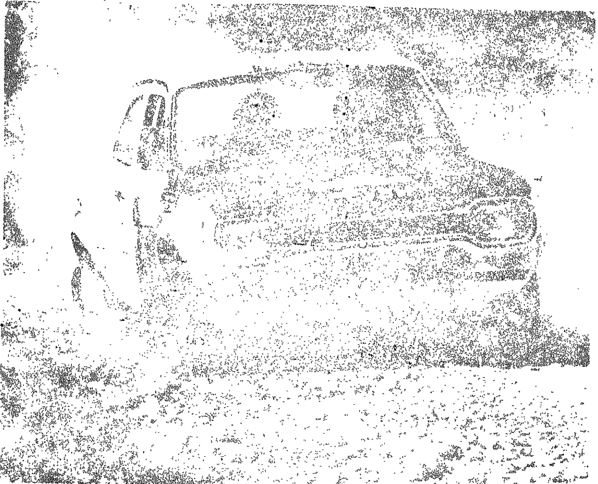
↑ ROGER CLARK 1970 SCOTTISH RALLY