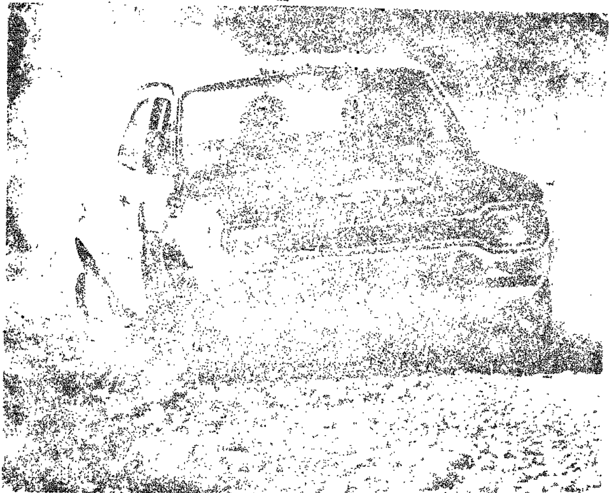
↑ ROGER CLARK 1970 SCOTTISH RALLY