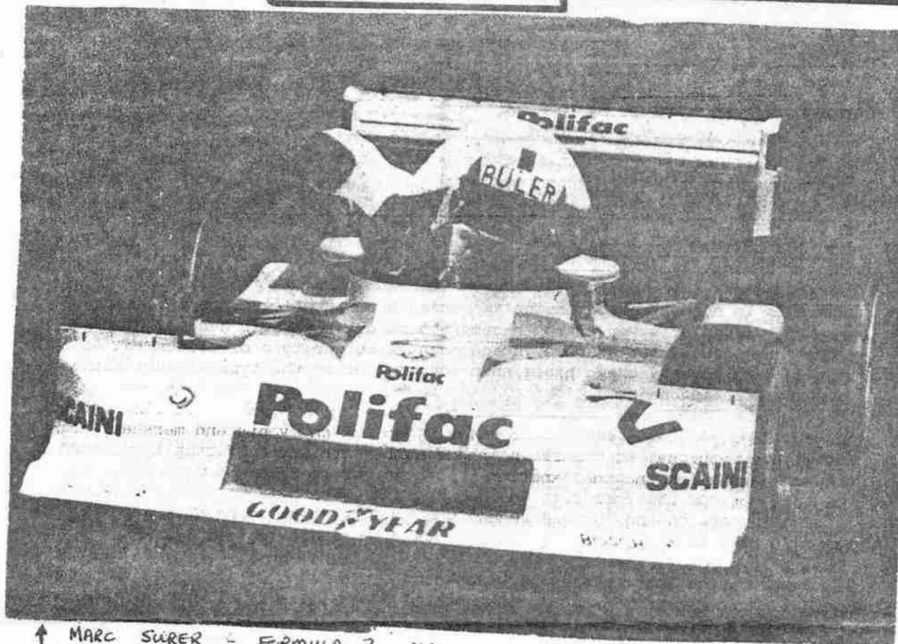
↑ MARC SÜRER - FORMULA 2 MARCH - BMW.