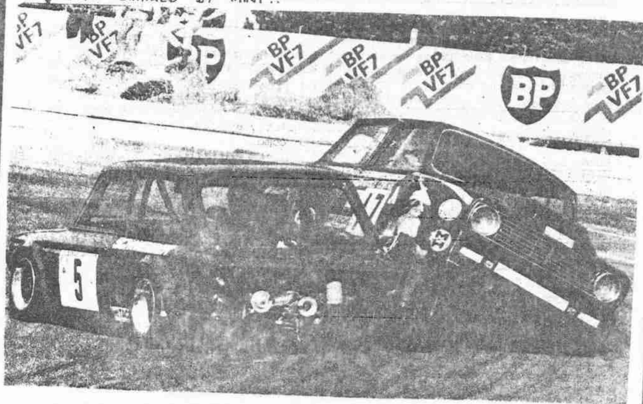
↓ IMP SAVAGED BY MINI !!