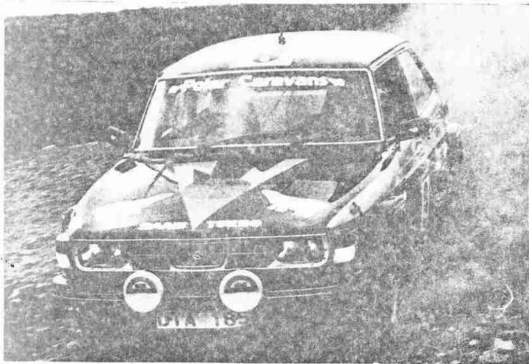
↓ STIG BLOMQVIST - SAAB TURBO - RALLYSPRINTING.