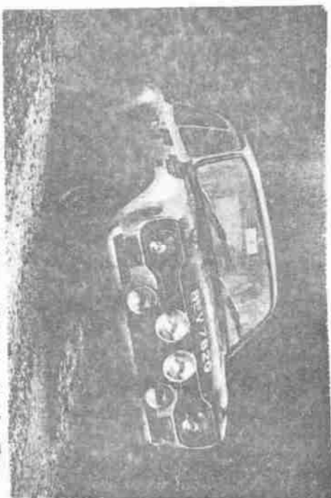
↑ CAN ANY OF YOU RALLY MEN TELL THE EDITOR WHO THIS IS AND WHICH EVENT? - NO PRIZES IF YOU'RE RIGHT!!