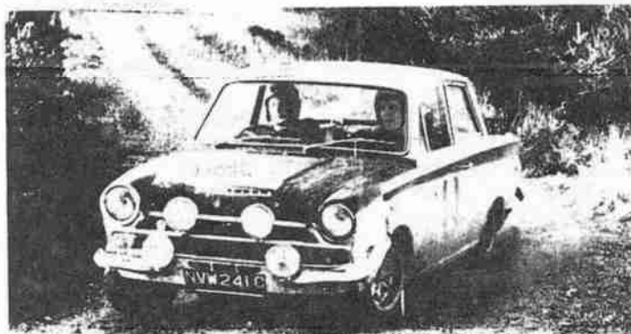
↑ 1966 - RAC RALLY AND THAT'S JIM CLARK SHOWING OFF HIS VERSATILITY!