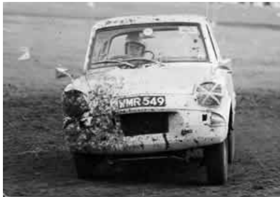
STEVE LLOYD - 105E ANGLIA AT MENDIP AUTOCROSS - 1966