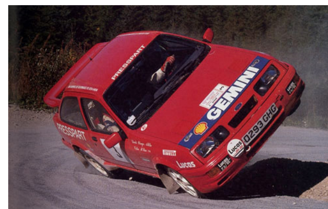
Colin McRae on his way to winning the 1989 Trackrod Forest Stages