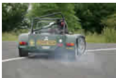
Paul Pushing a bit too hard