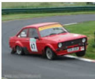
Darren three wheeling round Farmhouse Bend

Thanks to all who were involved in the event hope to see you all there next year.