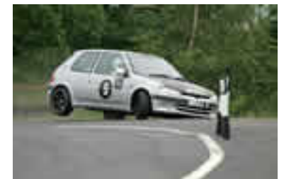
Some photo's from the BBQ Hillclimb