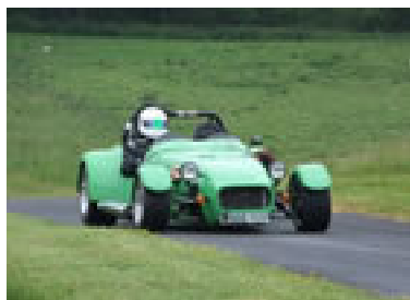
Tom entering Country Corner