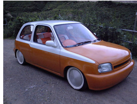
Concept of what Nissan Micra's will look like in the future