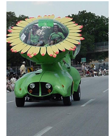
Two of the most green and environmentally friendly cars on the market